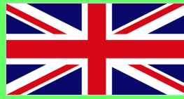
United Kingdom of Great Britain and Northern Ireland (full name)

countries, there is no border control between them, and you don't need a passport to travel within the UK.